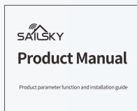
Product specification × 1