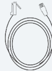
Cat 6 Cable × 1 (1 meter)