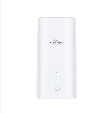
XM530 × 1